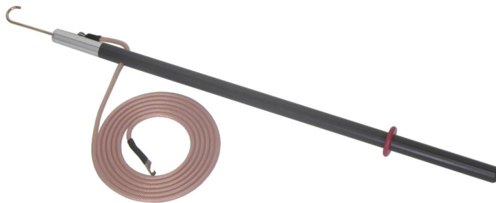
ES30 Earthing stick

Supply lead, spare fuse set, operating manual, earth lead, DS30 earthing stick.